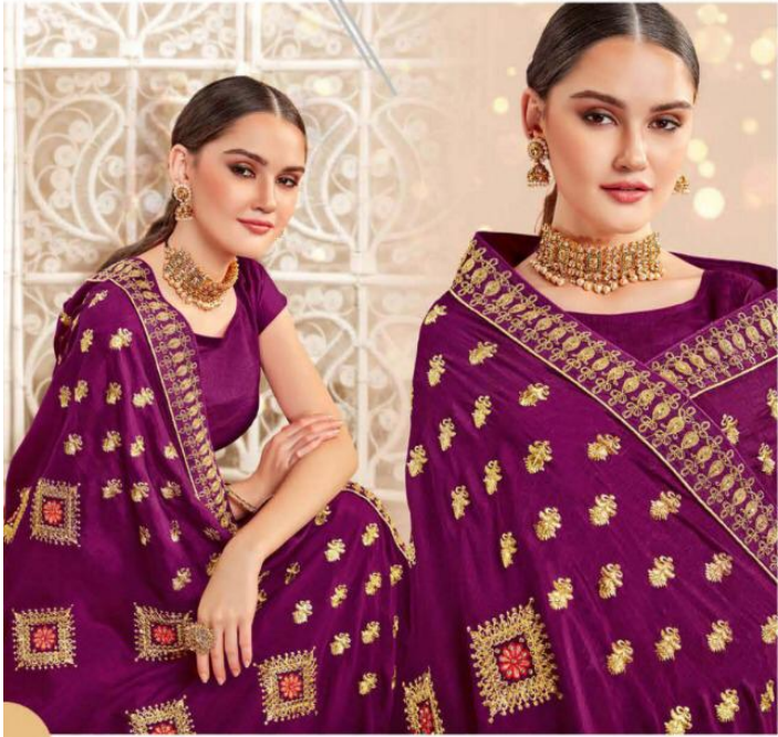
STYLE MEETS ATTITUDE