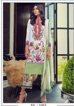
SS | 1003