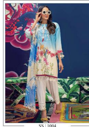
SS | 1004