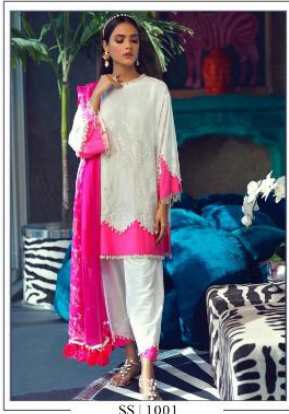
SS | 1001