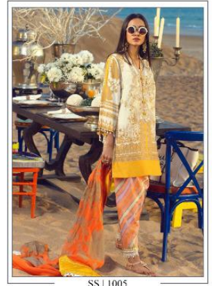
SS | 1005