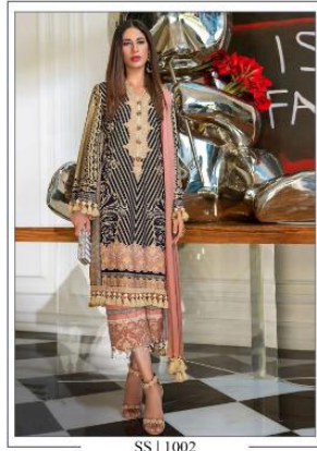
SS | 1002