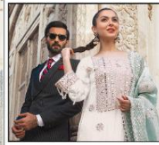
D.NO. C 3111 B