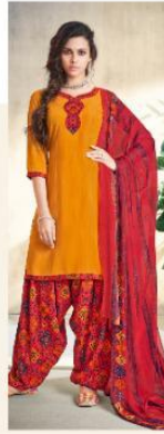
D // 3001