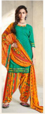
D // 3004