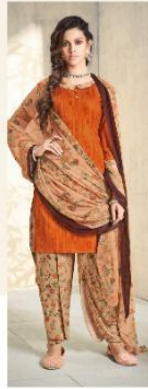
D // 3005