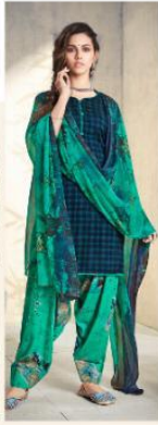
D // 3002