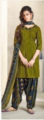
D // 3006