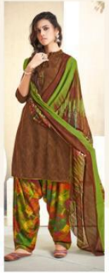
D // 3008