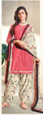
D // 3003