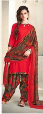
D // 3007