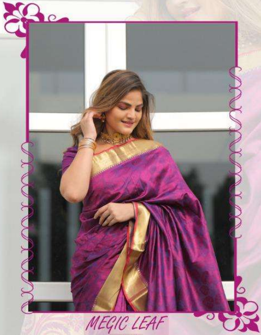
MAGIC LEAF 1001