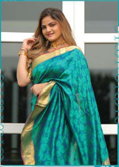
MAGIC LEAF 1002