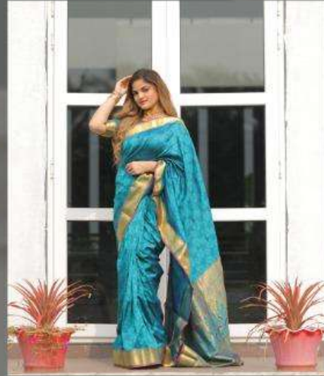
MAGIC LEAF 1002