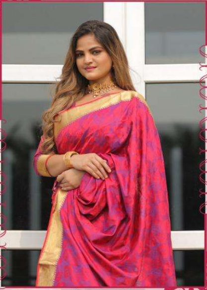
MAGIC LEAF 1004