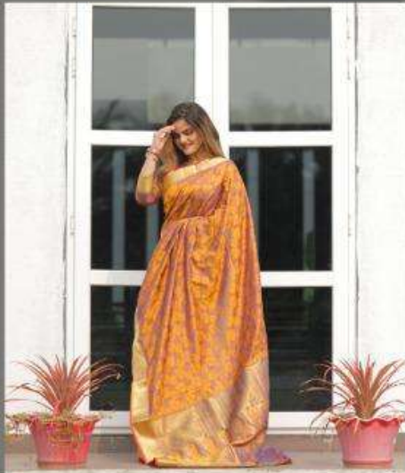
MAGIC LEAF 1003