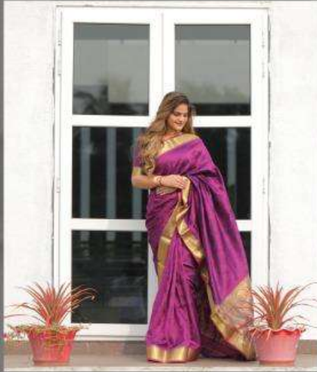
MAGIC LEAF 1001