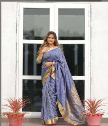
MAGIC LEAF 1005

L LAKHANI COTTONS WE BELIEVE IN QUALITY MAGIC LEAF