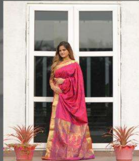
MAGIC LEAF 1004