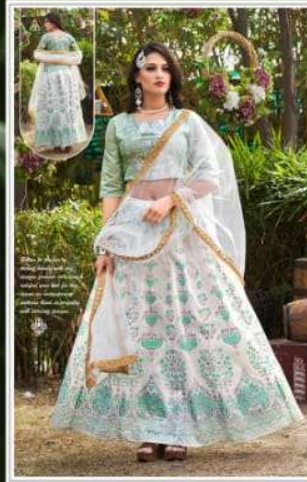
REPLACE YOUR TOUCH