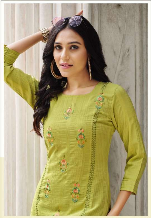
GREY AND YELLOW STILL REIGN TO BE THE COLOR OF THE YEAR. THE CONTRAST FLORAL ADORNMENT IS OUR GO-TO-STYLE THIS SEASON.