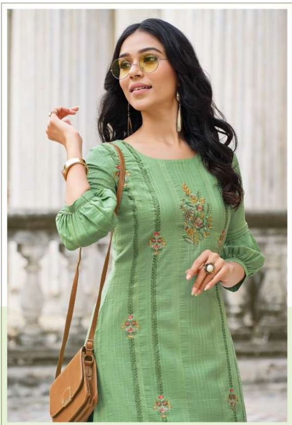
A COMBINATION OF FLORAL AND GEOMETRIC MOTIFS IN FABRIC THAT'S ULTIMATELY LIGHTWEIGHT AND STYLISH