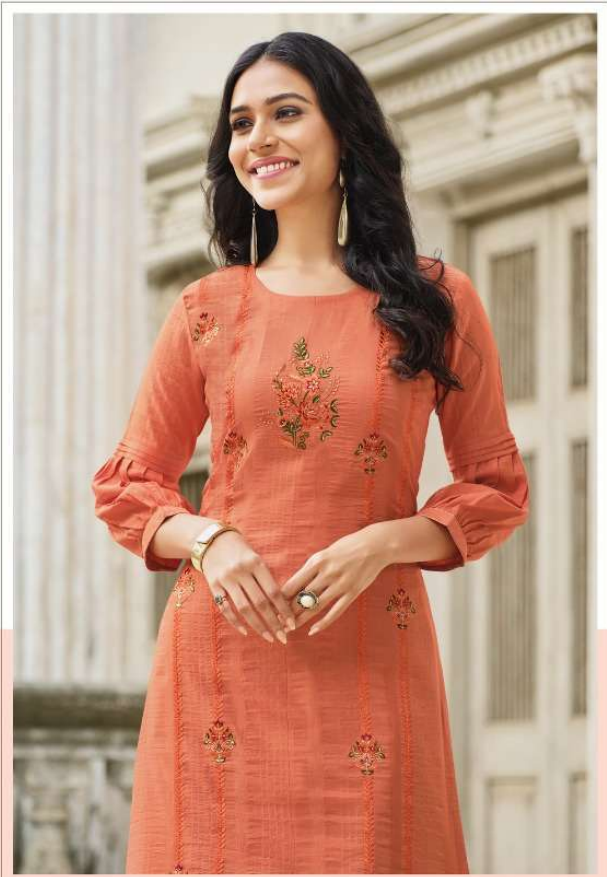
A TRENDING TIE-DAY EFFECT IN SUNSHINE GOLDEN HUE WITH PERFECT HINT OF SEQUINED SHIMME