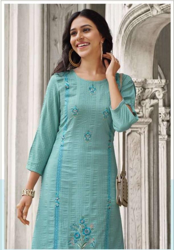
A FEMININE FAVOURITE COMBINATION OF LIGHT-WEIGHT FABRIC.FLOWERS AND PASTEL COLOR