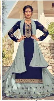
CODE \ 7305