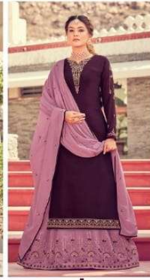
CODE \ 7306