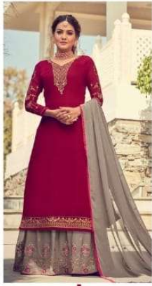
CODE \ 7304