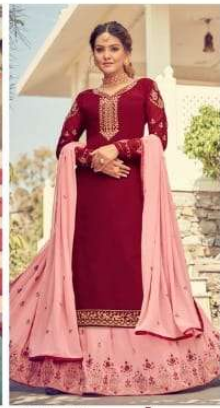
CODE \ 7302