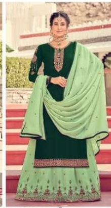
CODE \ 7303