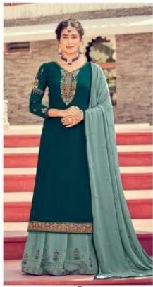
CODE \ 7301