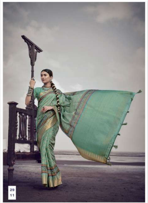
AS SERENE AS THE NATURE