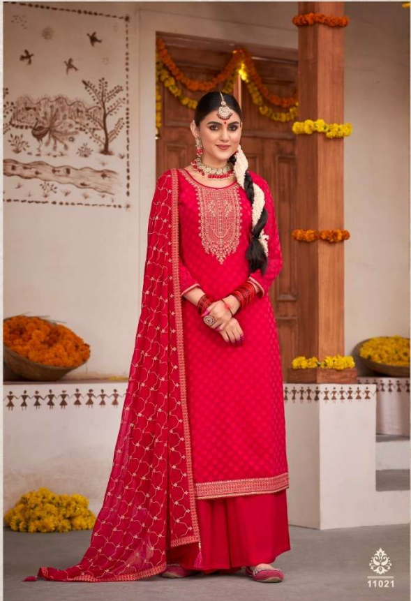
Pure grace, elegance and beauty , The best creates, the rest follows ...