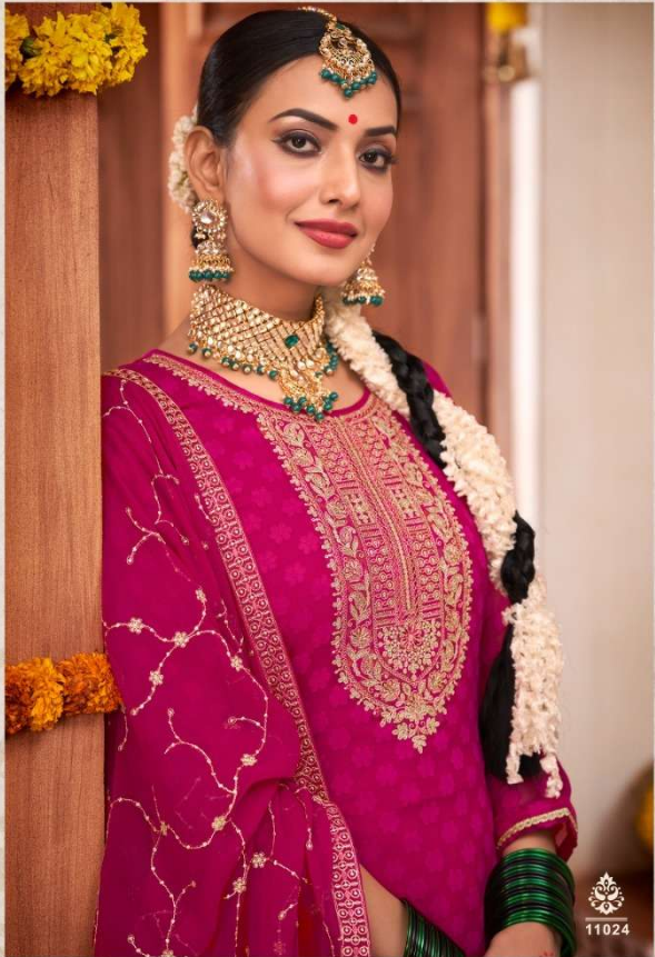
Fashion is a language which tells a story about the person who wears it ...