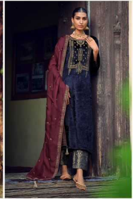
❖❖ D.10466 ❖❖