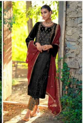
❖❖ D.10468 ❖❖