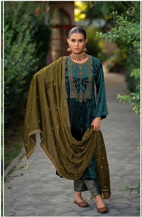
❖ D.10462 ❖