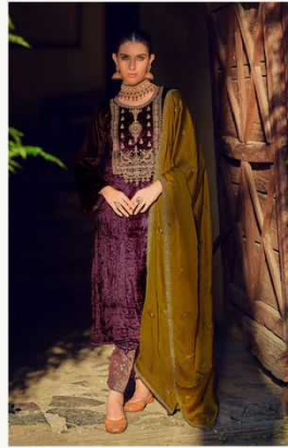
❖❖ D.10465 ❖❖