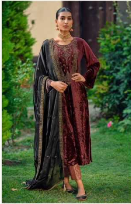
❖❖ D.10461 ❖❖