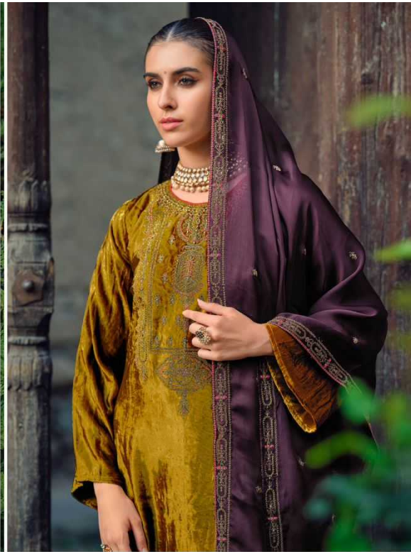
❖ D.10463 ❖