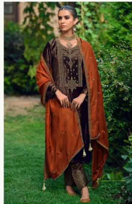
❖❖ D.10467 ❖❖