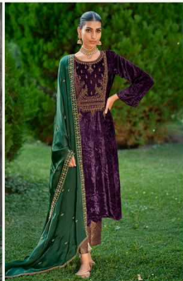
❖❖ D.10464 ❖❖