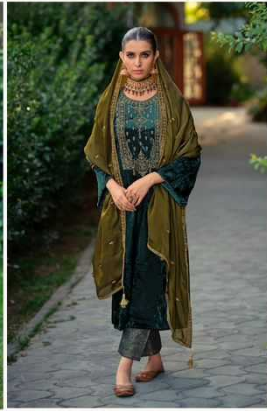
❖❖ D.10462 ❖❖