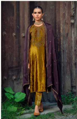
❖❖ D.10463 ❖❖