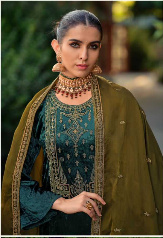
❖ D.10462 ❖