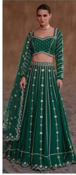
CODE - 5396