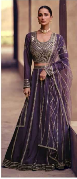
CODE - 5394