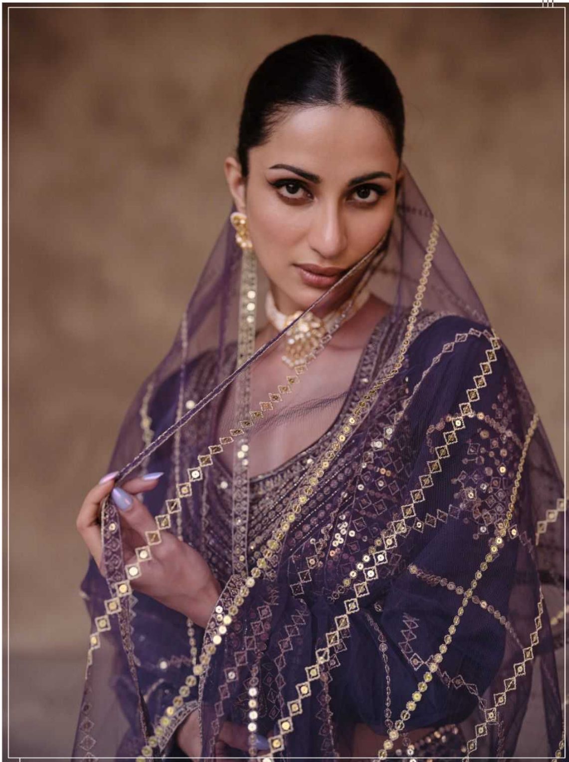
A breath taking array of fine detailing & intricate design inspired by Indian culture ..... CODE - 5394