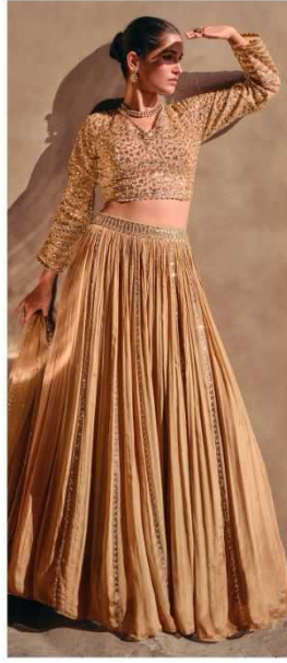
CODE - 5395