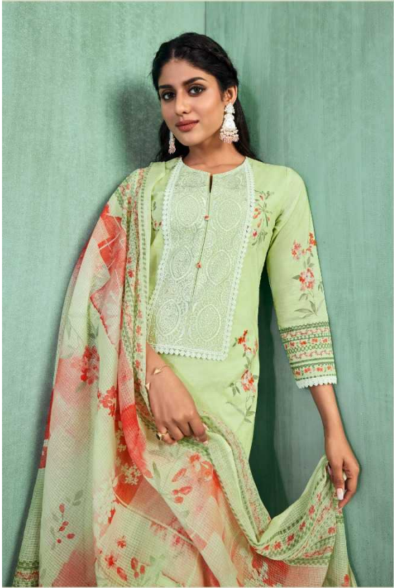
Amora ♦ 1003