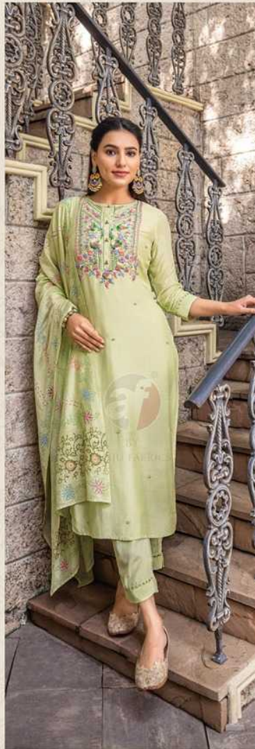
GOLDEN 3632 Meadows