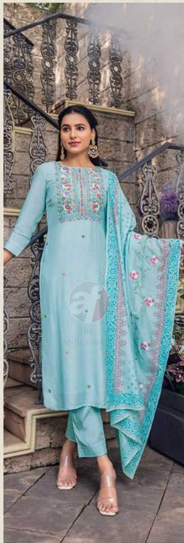
GOLDEN 3635 Meadows