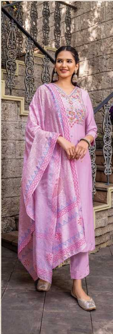
GOLDEN 3631 Meadows