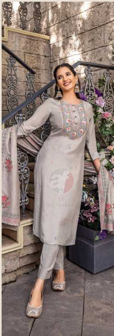
GOLDEN 3634 Meadows