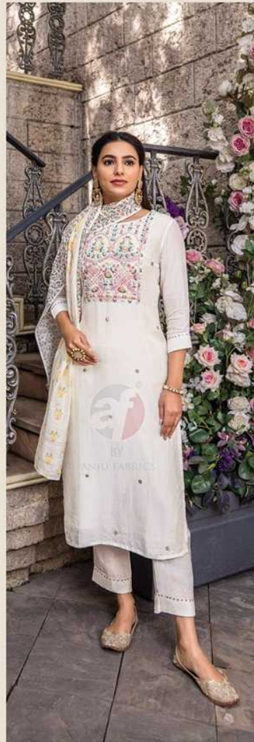
GOLDEN 3633 Meadows