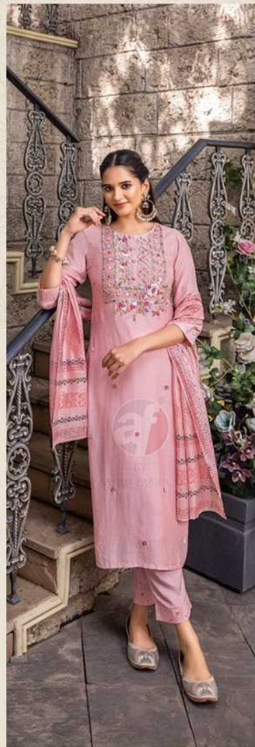
GOLDEN 3636 Meadows