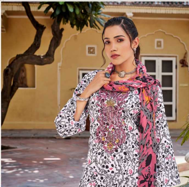
D.NO 6017 One is never over-dressed or under-dressed with a Little Black Dress.