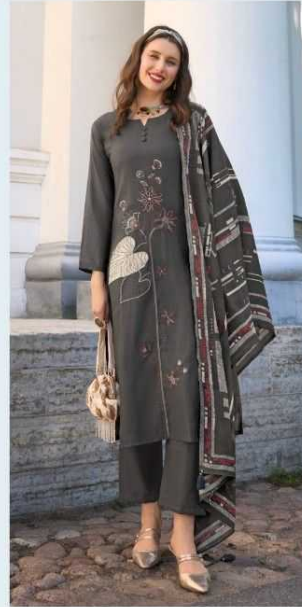
RANG : 1003