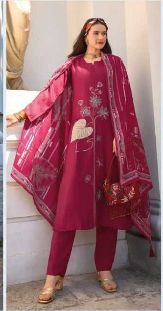
RANG : 1004