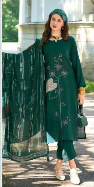
RANG : 1002