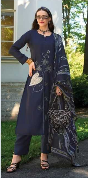
RANG : 1001