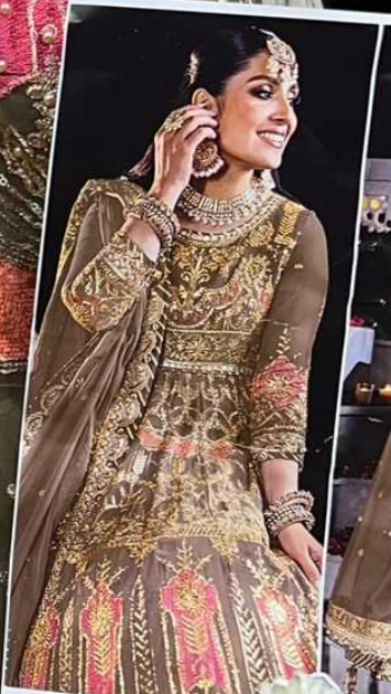
CHANTELLE Vol-7 TOP Butterfly net with Embroidery BOTTOM-INNER Dull Santoni DUPATTA Butterfly net with Embroidery