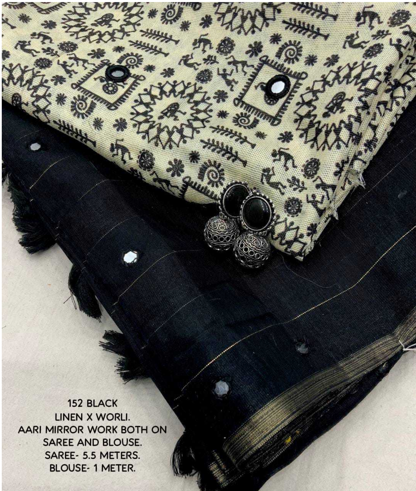
152 BLACK LINEN X WORLI. AARI MIRROR WORK BOTH ON SAREE AND BLOUSE. SAREE- 5.5 METERS. BLOUSE- 1 METER.