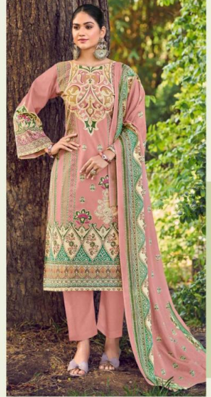
104 / HASEEN