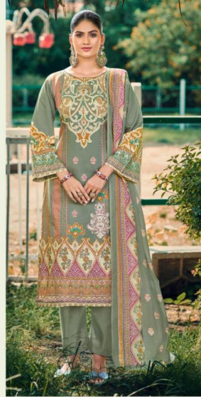
103 / HASEEN