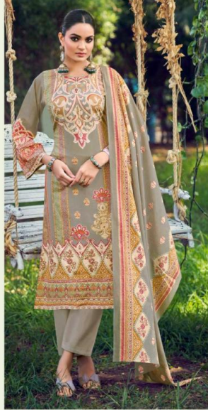
102 / HASEEN