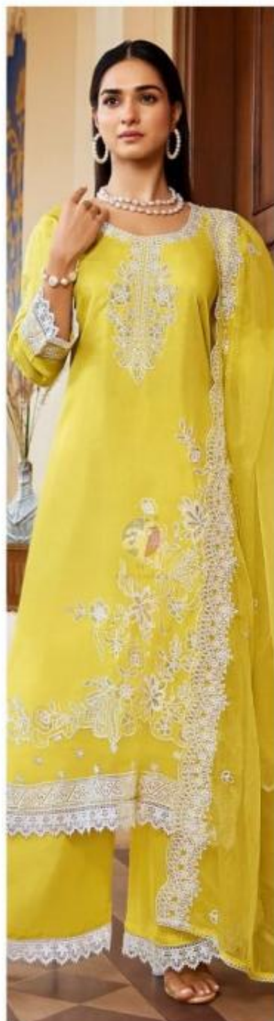
4242 SARGAM VOL. 02