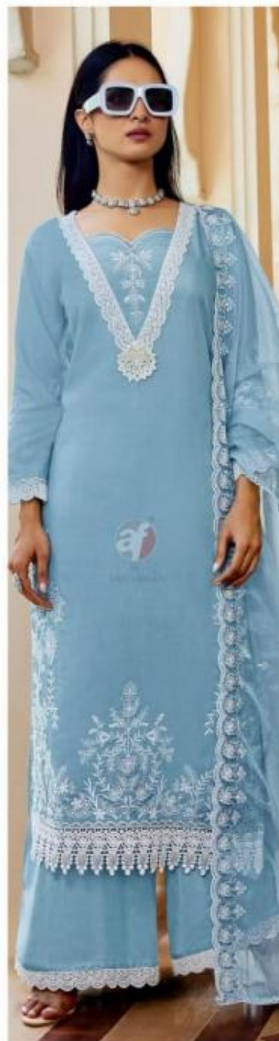
4243 SARGAM VOL. 02