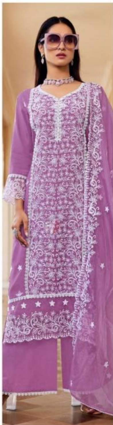
4241 SARGAM VOL. 02