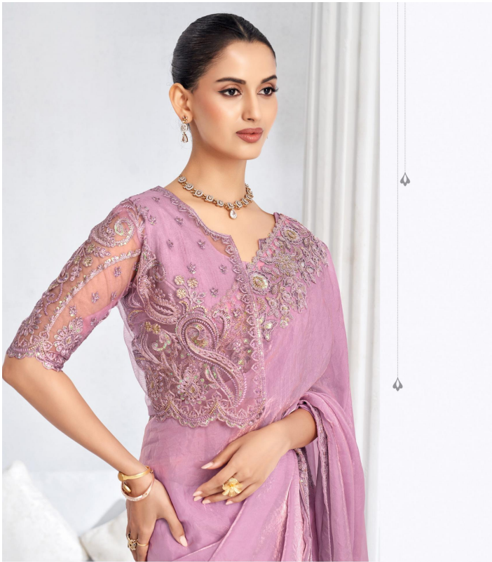
Showcasing excellent work and craftsmanship, each one of these piece will make for a class apart style in your wardrobe.