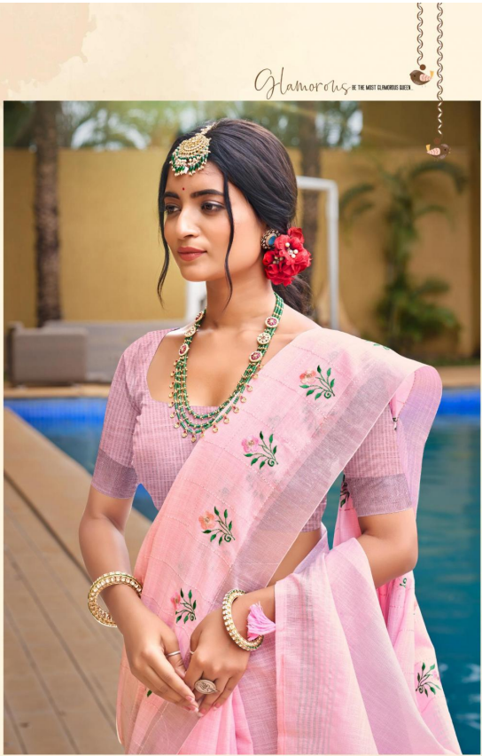
With it's vibrant prints, bold colors the new season on the indian runway is the perfect mix of modern and ethnic. all you have to do choose your favourite.