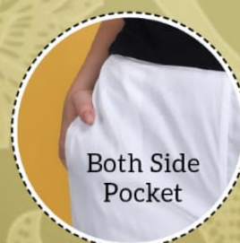
Both Side Pocket